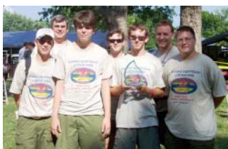
Eswau takes home the NOAC Spirit Award

The most important aspect of NOAC is training. The NOAC staff offered top notch trainers to teach the training cells held every day. Arrowmen had the opportunity to attend six cells while at the conference. Training was