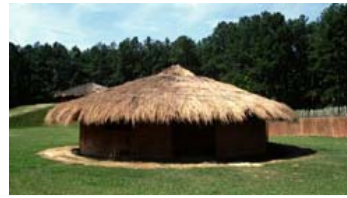
Town Creek Burial Mound

two sites come to mind: Town Creek and Cherokee. Town Creek Indian Mound State Historical Site is in Stanley County