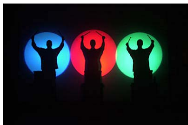
The OA Presents Scoutopia

The Indian Village, located just behind Merit Badge Midway, was quite interesting. With daily pow wows and Indian Lore merit badge classes, many scouts received a new understanding of