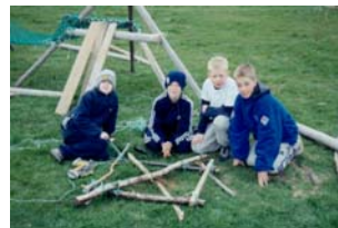
Ulfar (Wolf) Patrol

Last of all, Iceland is a country with a relatively small population. With 290,000 citizens and about 4,000 scouts, the Icelandic scouts always invite scouts of other nations to their own national jamborees. The next Icelandic jamboree will be held from July 16 th through the 23 rd of 2002. The theme for the event will be Elves and Trolls. To learn more about the jamboree and how to attend, visit its website at www.scout.is/jamboree2002 .