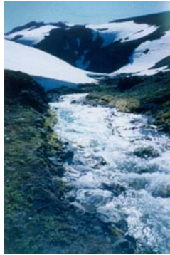
Grimsvotn Creek on Vatnajokull Glacier

This summer I was a member of the European Camp Staff Program in Iceland. The name of the camp I worked at was Utilifsmiostto skata Ulfjotsvatni, but was commonly called "Oolishwha." Girls and boys, of whom most were not scouts, attended the camp. Of the ten weeks of camp, the two weeks the camp hosted the 6,7, and 8 years old children were my favorite. I believe I was nearly wrestled, hugged, and forced to draw pictures to the point of near exhaustion. It was all great fun though.